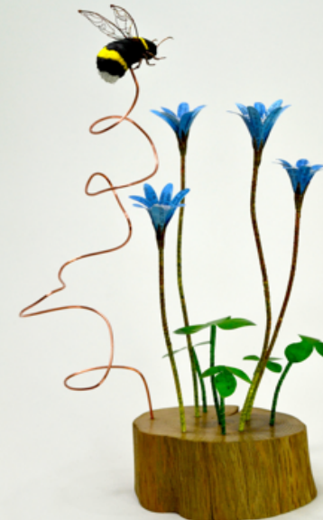
Hepatica & Bee