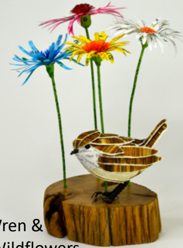
Wren & Wildflowers